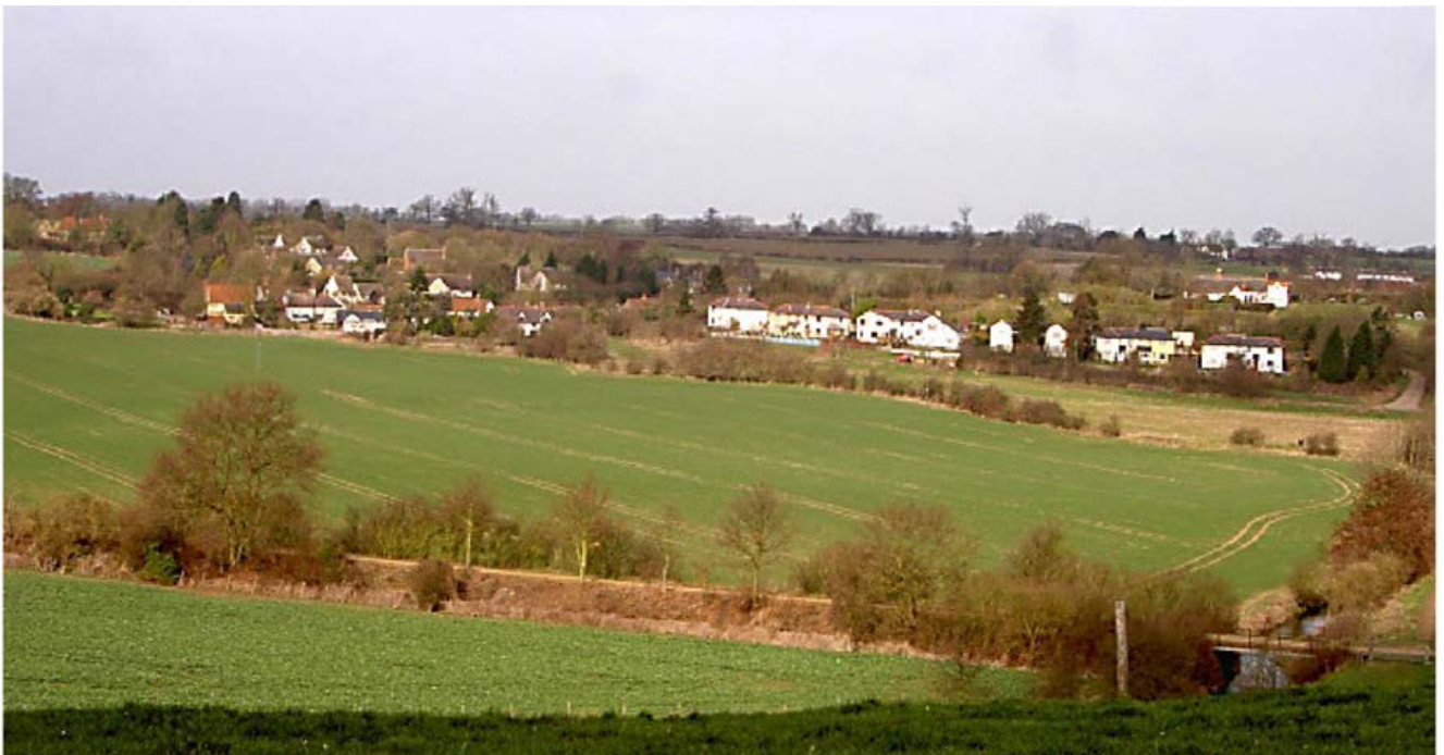
Wareside from near Hogham's Wood with old railway in foreground

Continuing along BR 19 you reach a point where the levels meet and the track merges with the bridleway. Shortly after this the path leads off to the left through the trees, follow this until you reach the B1004 road. Cross the road and follow the footway past the old station, now a coal and garden sundries depot, until you reach Widfordbury Farm on your left. Turn right here and cross the road joining Widford RB 20. Follow this up the hill to a small wood, Townlands, turning round at the top of the hill to take in a further wide view from Wareside round to Widford Rise. From Townlands the path becomes Hunsdon RB 12, giving views over Hunsdon and after initially going downhill, ultimately takes you back to Hunsdon village centre.